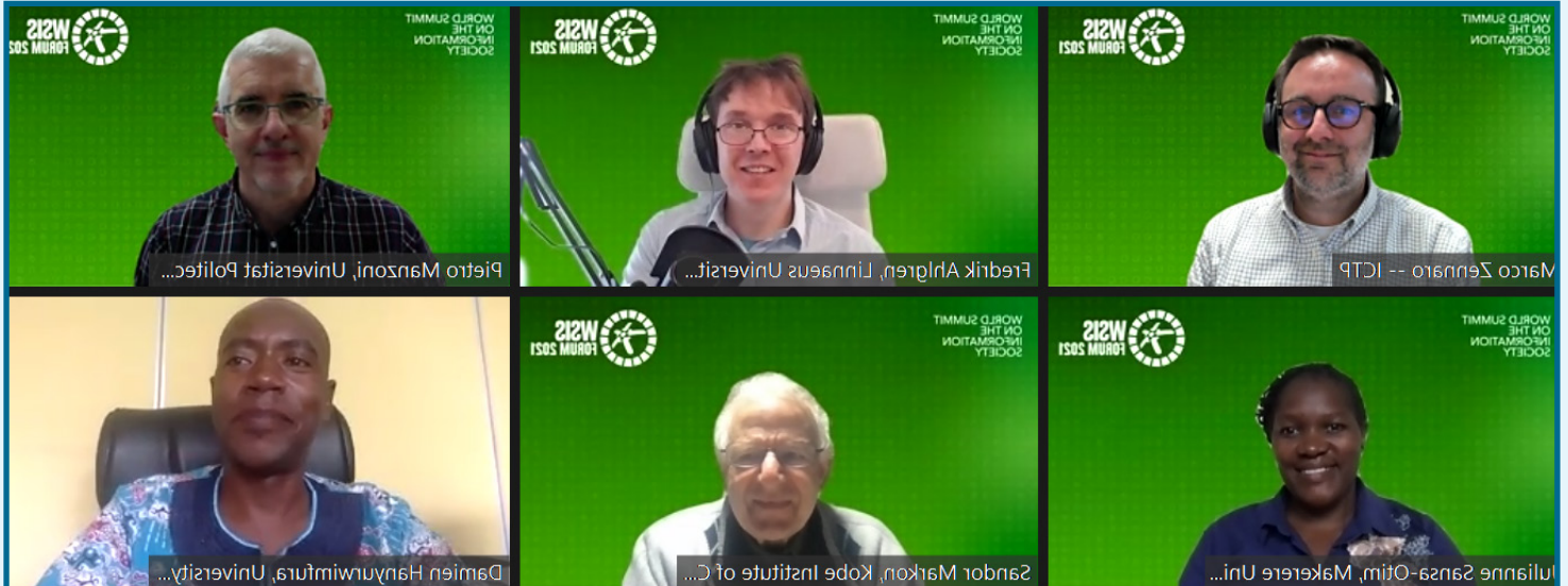
The workshop took place virtually due to Covid-19 restrictions

T he African Centre of Excellence for Internet of Things has shared with different higher learning institutions best practices in teaching the internet of things in order to discuss together how to improve IoT teaching. These best practices were shared during a workshop, which put together representatives of institutions dealing with education of internet of things.