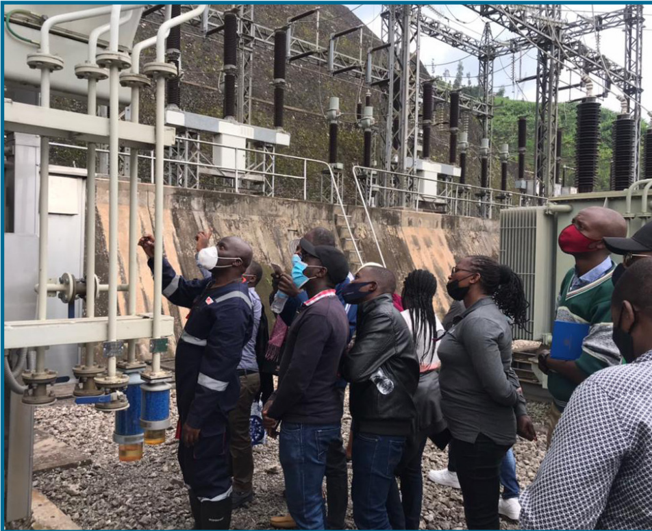
Master students from ACEESD at Ntaruka

4 0 Master students from African Centre of Excellence in Energy for Sustainable Development (ACEESD) specializing in Energy Economics, Renewable Energy and Electrical Power Systems visited Ntaruka Hydropower plant to have their theoretical skills linked with technical experience.