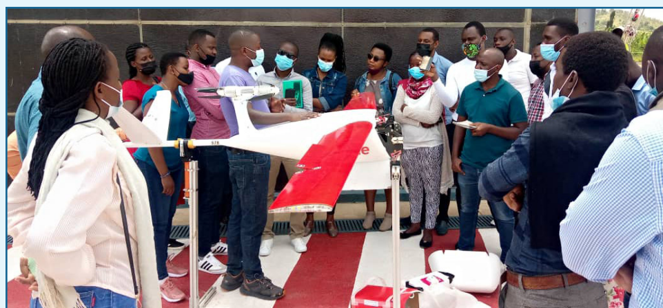
ACEIoT students receiving details on drones operations

Students have recommended the Centre to keep on organizing such visits as the knowledge package obtained on field boosts the students' understanding of module and helps being familiar with real life situation of what they learn in class.