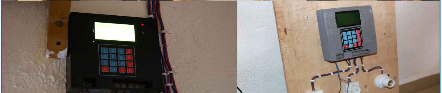
One of incubitees explaining his innovation

G rid Innovation and Incubation Hub (GIIH) is a research, innovation and entrepreneurship initiative that is hosted by the African Centre of Excellence in Energy and Sustainable Development (ACEESD) in the College of Science and Technology (CST) at the University of Rwanda under the World Bank funding.