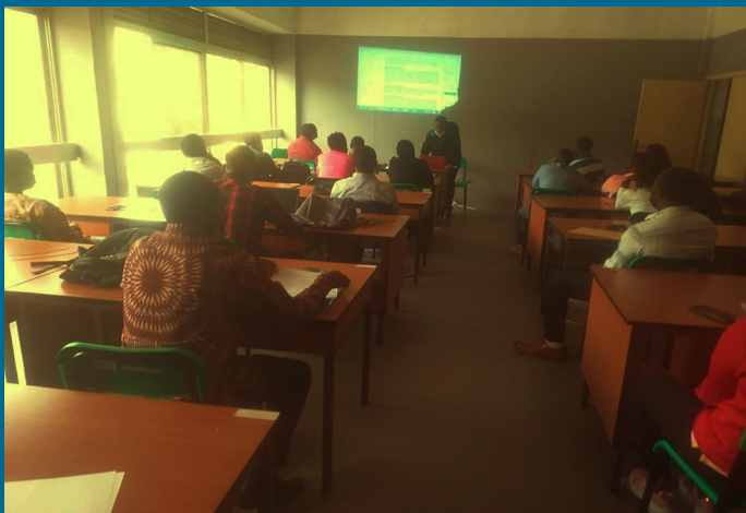
ACEIOT received Master students