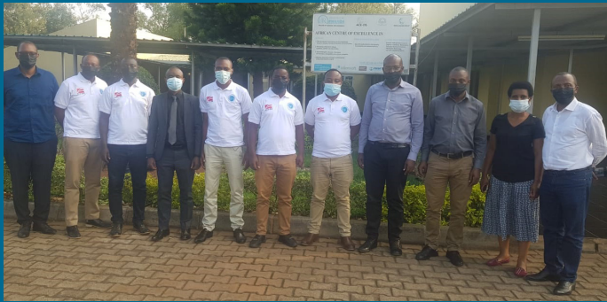
ACEDS received PhD students