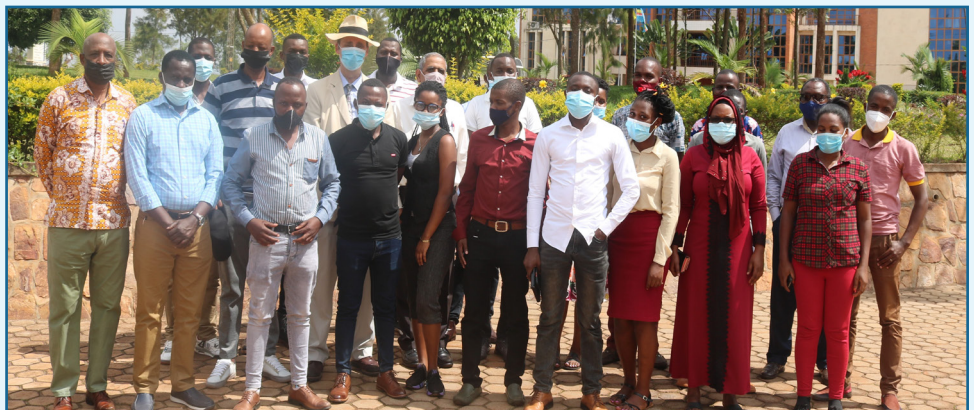
Students posed with trainers

Such workshops were also organized for all previous cohorts and have proven to be a very important support to students.