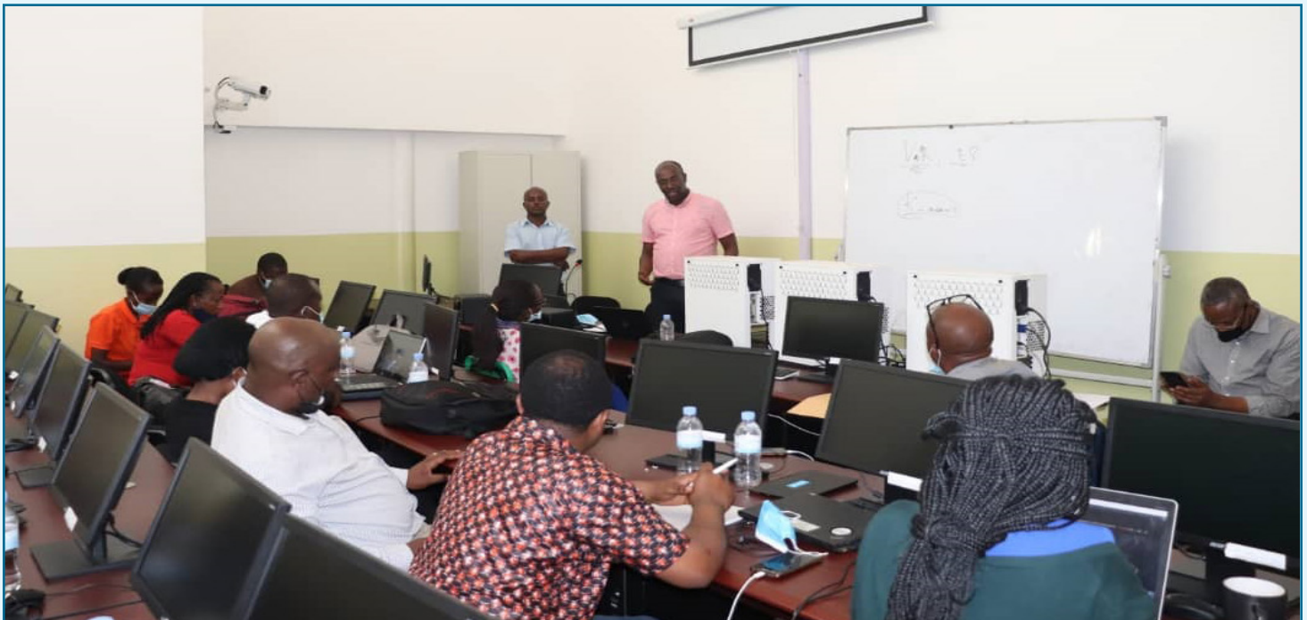
Students during training in English for Academic Writing and Communication

F rom 21 st to 24 th December 2021, 29 PhD students held a four day training on English for Academic Writing and Communication. The training aimed at equipping PhD students with English for Academic Writing and Communication, distinguishing types of Academic Writing, acquainting students with skills to write publishable articles and familiarizing PhD students with referencing styles and avoiding plagiarism.