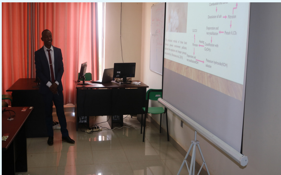
A young incubatee exhibiting his energy innovation

The African Centre of Excellence for Innovative Teaching and Learning Mathematics and Science (ACEITLMS) in collaboration with SAKURA-SHA K.K, a private company registered in Japan have jointly organized a one-day on 19th August 2022 at UR-CE Remera Campus training of teachers and lecturers on Mathematics teaching method utilizing hand-made teaching/learning tools.