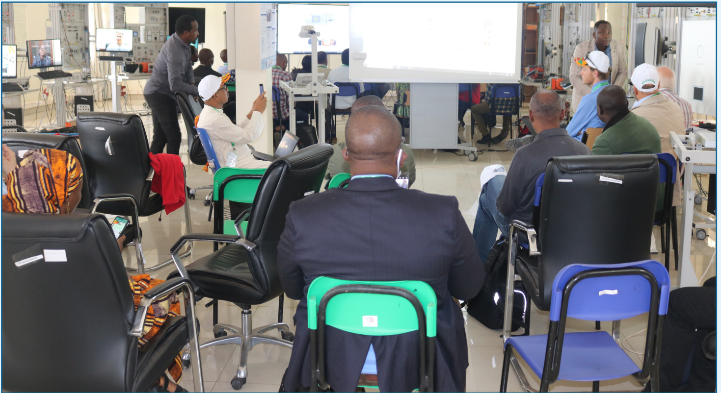
Summer school session at ACEESD

F rom 22nd to 26th August, Rwanda hosted the IEEE PES/IAS Power Africa Conference 2022. The conference took place in Kigali with participants from across Africa and the world to explore energy and electric power infrastructure developments in Africa.