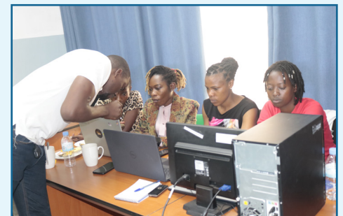
PhD and MSc students

“I have been interested by this training because I wanted to deepen my knowledge in internet of things and I hope the skills I get will contribute to the project I am working on for my master program”, she said.