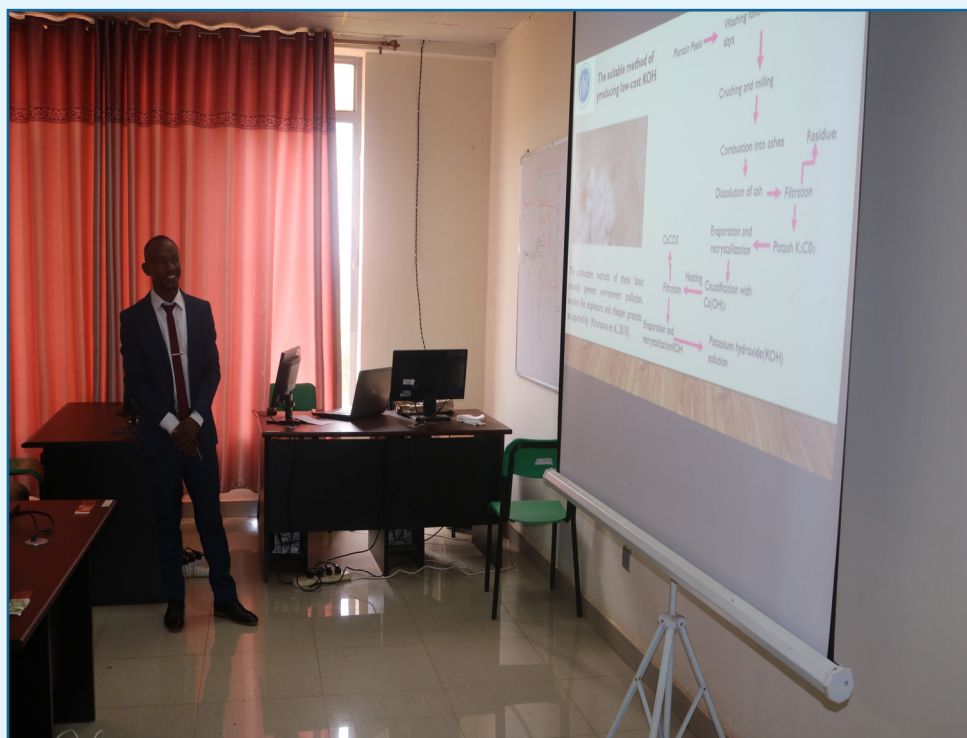
After discussions, participants posed for a group photo

of the requirements for the completion of the MEd programme.