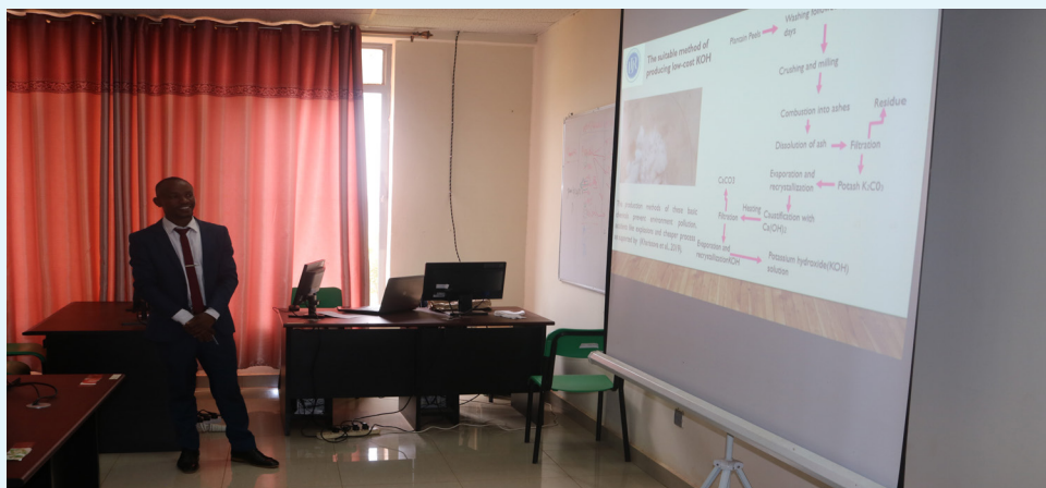
Cooking stove is one of exhibited innovations

At the end of the workshop, three persons were awarded the certificate as master trainers of interactive mathematics software.