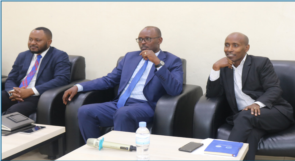
Learning session in Nyarugenge