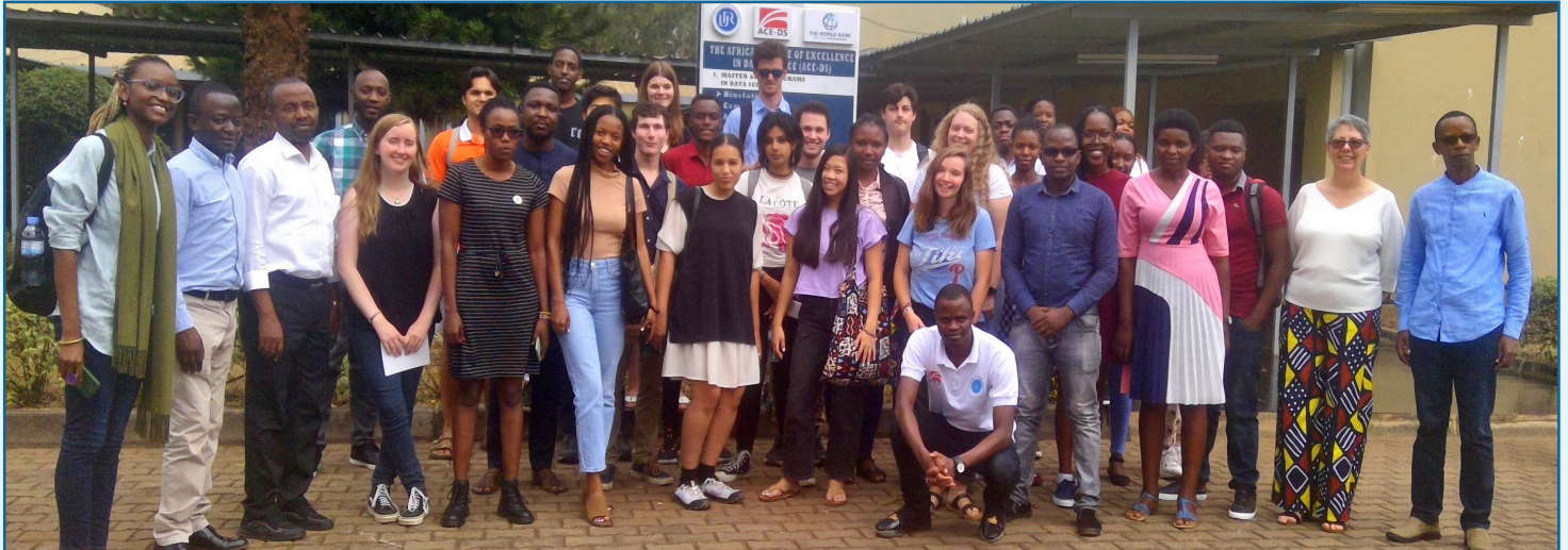
Learning session in Nyarugenge

T he African Centre of Excellence in Data Science (ACE-DS) is set to establish the Data -Driven Incubation Hub to bridge the gap in academia-industry collaboration specifically in data-driven researches.