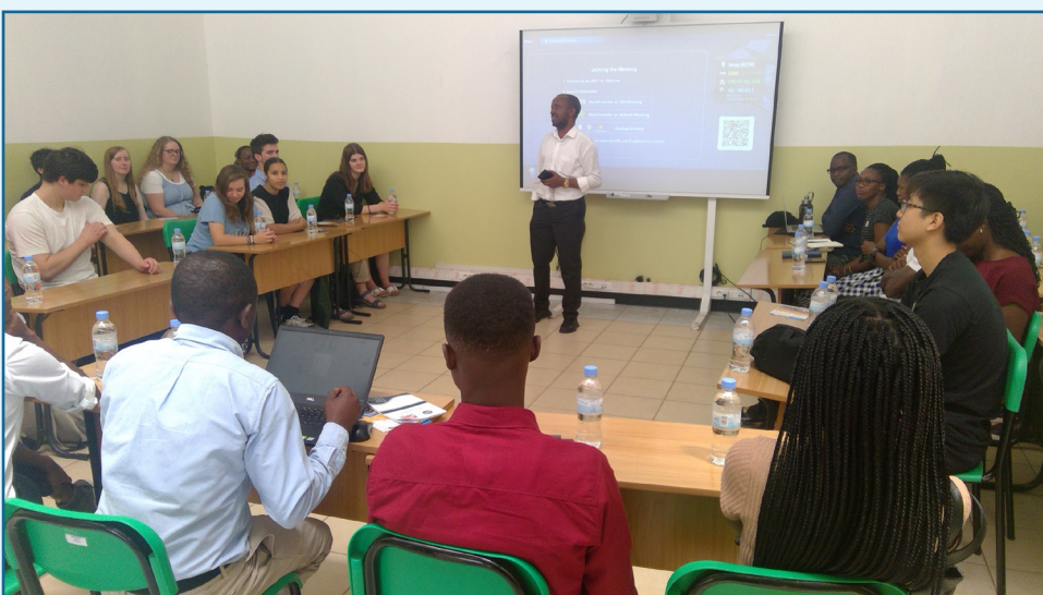
Learning session in Nyarugenge

The Hub will serve as the place for development of data-driven research area through industrial-academia that has industrial impact and business value, establishment of a nationally leading and internationally recognized data-driven research environment, capacity building (people and competence) at the university within the areas of primarily big data analytics, data mining, machine learning, decision support systems, and data collection systems and creation of a tangible academia-industry collaboration among others.