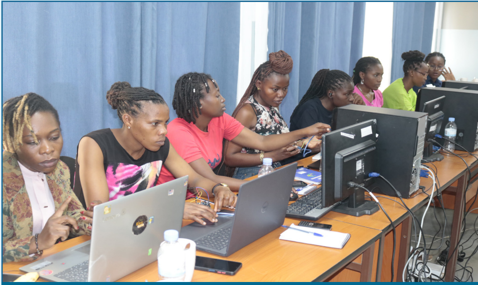
PhD and MSc students pose for a group photo after the training

5 Twenty females young graduate graduates are undertaking a four-month training to build their IoT related business and entrepreneurship skills capacity in ICT. The training is also meant to enhance ICT skills for job creation and competition through small business ideas.