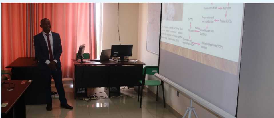
After discussions, participants posed for a group photo

Thirty-three MEd students have, in presence of external and internal examiners, defended their research theses as one