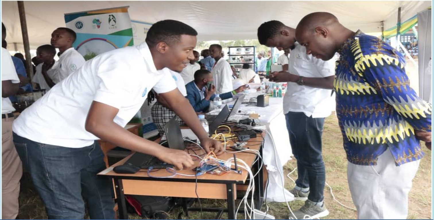
One of ACEIoT students explaining different prototypes being developed at ACEIoT

On 10th November 2022, students from the African Centre of Excellence in Internet of Things (ACEIoT) participated and exhibited their innovative projects in the exhibition which was organized in line with the celebration of the World Science Day celebrated in Nyanza District, Southern Province.