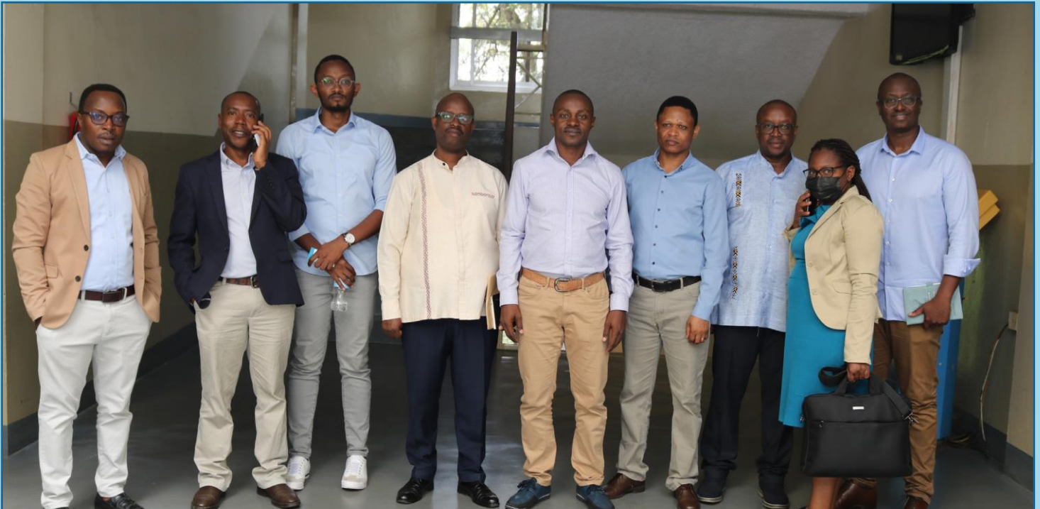
A group of guests and Centre Management after interactions

O n 5th October 2022, a team of Rwandan scientists and innovators from Diaspora communities visited the African Centre of Excellence in Internet of Things (ACEIoT). The main objective of their visit was to discuss with the Centre potential collaboration mechanisms in areas of research and innovations and how they can support the Centre to achieve its mandate.