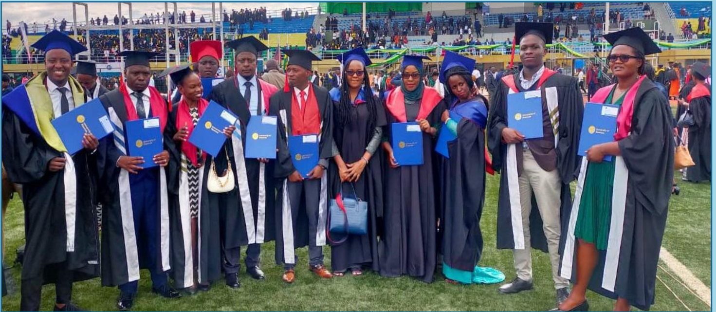
Some graduates from ACEIoT

“Having greater abilities to play enhanced roles individually and collectively in the social, economic and political transformation of our countries, continent and the world is the standard gauge against which you will be measured from now onwards”, he said.