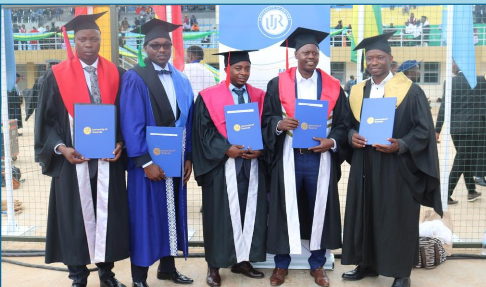
Some Master’s graduates among 83 from ACEITLMS

Previously students had to wait for a long time after graduation to get their degree certificates. It is an improvement the University is proud to have made.