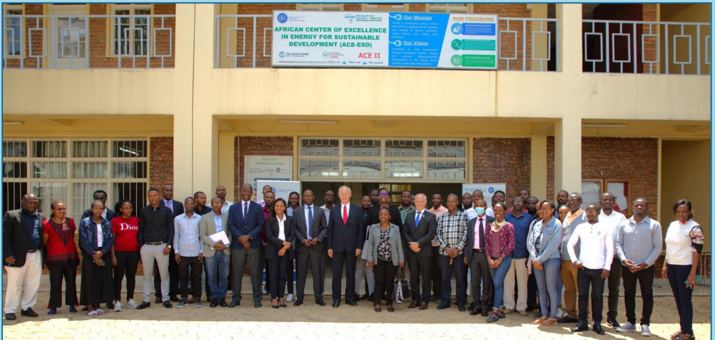
Representatives from Total Energies, MINEDUC, UR and students pose for a group photo

T otal Energies, a well-renowned company specializing in renewable energy is set to provide expertise and skills to Rwandan energy professionals to improve the energy sector in Rwanda. This was highlighted during a kickoff ceremony of a three-day series of lectures on renewable energy at the African Centre of Excellence in Energy for Sustainable Development (ACE-ESD).