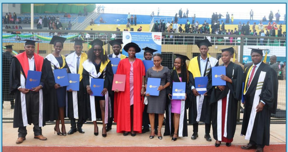
24 Masters and 2PhDs graduated from ACEDS