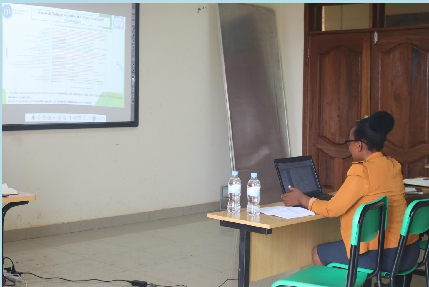
One of the candidates presenting her proposal

From 18th to 20th November 2022, the African Centre of Excellence for Innovative Teaching and Learning Mathematics and Science (ACEITLMS) conducted a workshop to evaluate 33 research proposals for MED Cohort two, Weekend programmes, a program being run in Kigali.