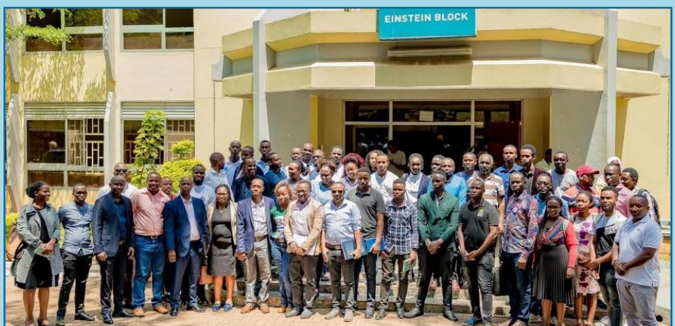
Participants to the meeting posed for a group photo after the meeting