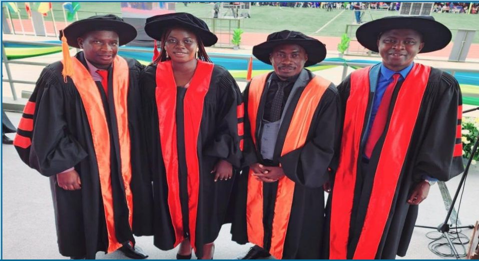
4 PhDs graduated from ACEESD

The Prime Minister Rt. Hon. Edouard Ngirente challenged UR graduates to impact and transform lives in their respective communities. He said becoming the agents of positive change by upholding the ethical values acquired from University should be top among their ambitions. The Prime Minister said this Friday 18th November 2022 during UR 8th graduation ceremony which took place in Nyagatare District, Eastern Province.