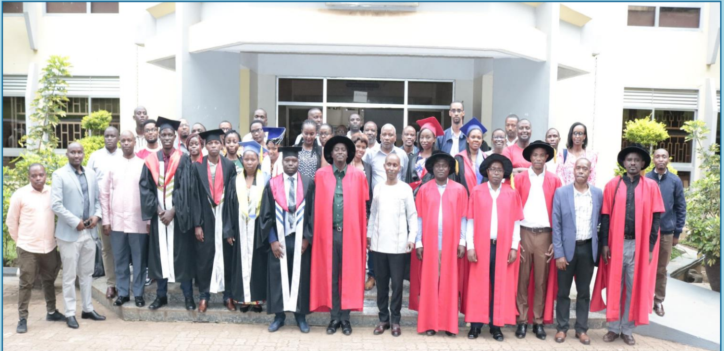
Masters and PhD graduates posed with principle for a Group photo