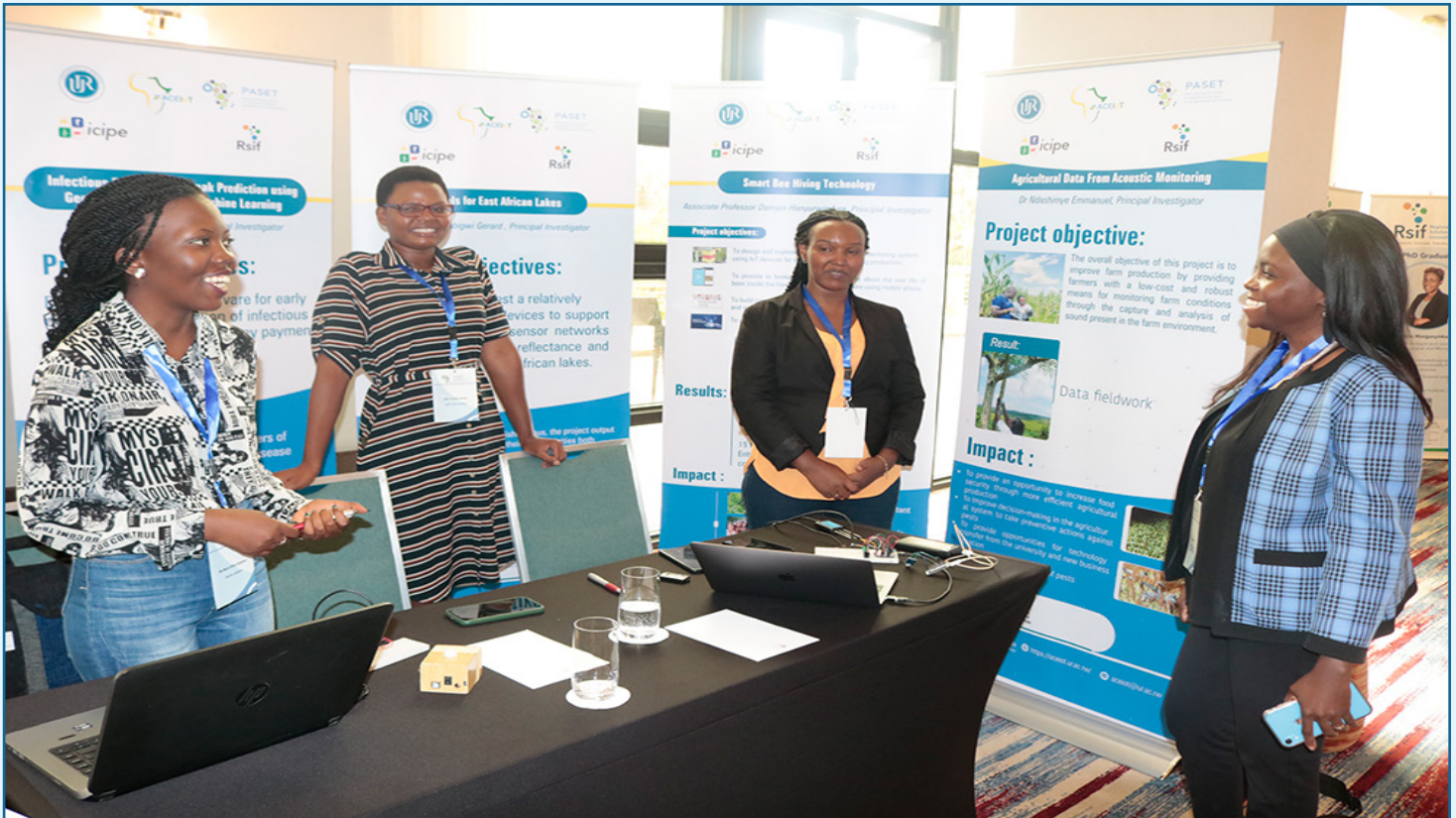
ACEIoT students during the exhibition

The African Centre of Excellence in Internet of Things has showcased its innovative project during PASET's Governing Council Meeting held in Kigali on 2 nd Feb 2023.