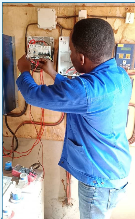
The innovator installing the device

I kept on contacting different experts in energy sector, and they told me that all renewables have intermittent, and are not predictable sources. Renewable sources cannot be reliable without power electronic technology integration”, he explained.