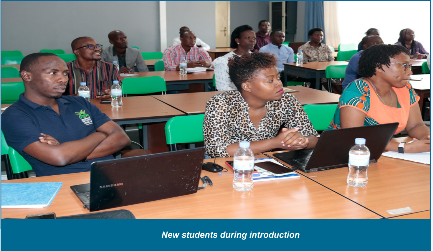
New students during introduction

O n 18 th January 2023, the Centre officially welcomed Master and PhD students who are admitted to the Centre to pursue different internet of things programs in the academic year 2022/2023.