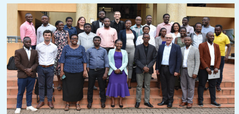
Participants posed for group photo

He asserted that at the ACEDS, they train students to become data scientists who can not only develop models but also develop solutions to the challenges that industries are facing.