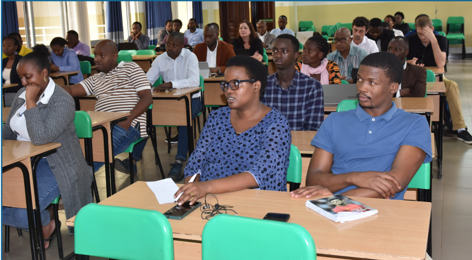
Participants during the public lecture

B uilding the right data talent starts when a person is still in school preparing to dive deeper into the data science profession. This is well grasped by both the African Centre of Excellence in Data Science (ACEDS) and Cenfri, which is implementing the Rwanda Economy Development Programme funded by the Mastercard Foundation.