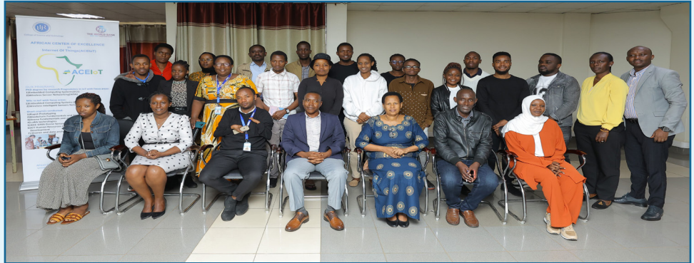
Participants to the launch posed for a group photo

Hanyurwimfura also noted that the $326,000 grant secured for the project will be used to buy equipment for the incubation hub and help the trainees to develop their AI and IoT based solutions and avail them on the market.