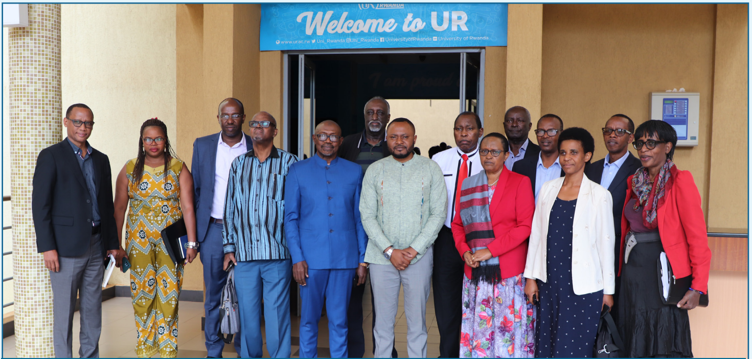
Elders and some UR senior managers posed for a group photo

M embers of the Rwanda Elders Advisory Forum have commended the research and innovations being carried out by University of Rwanda staff, demanding that more effort be put in to materialize their findings for actual community benefit.